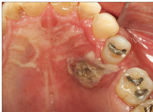
Figure 1: Clinical view of an ulcerative lesion on the left hard palate, diagnosed as TUGSE showing angiocentric/angiodestructive pattern