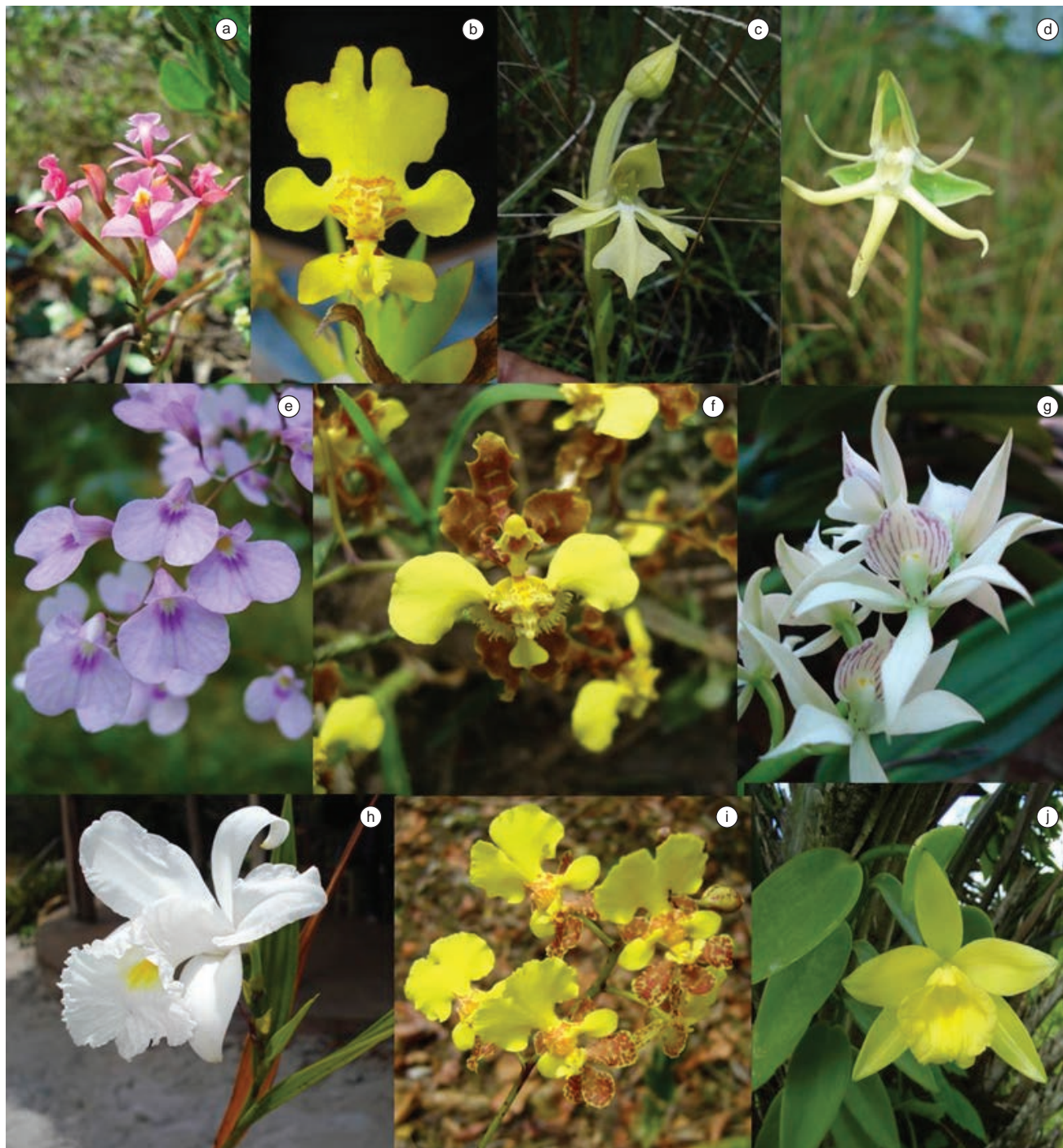
Figure 3. Some species of orchids in Sergipe. a. Epidendrum secundum, b. Erycina pusilla, c. Habenaria pratensis, d. Habenaria trifida, e. Ionopsis utricularioides, f. Gomesa barbata, g. Prosthechea aemula, h. Sobralia liliastrum, i. Trichocentrum cebolleta, j. Vanilla palmarum.

contribute to our knowledge about the species and distribution of a taxonomic group.